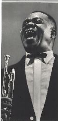
LOUIS (SATCHMO) ARMSTRONG adds new laurels to his enduring fame in "Jazz On A Summer's Day," a film by Bert Stern. Satchmo, his trumpet and famous vocal growl are highlighted in the motion picture coming to the Theatre, on ..... Scene Mat 1B

"Jazz On A Summer's Day" has found all over the world proves that with Bert Stern, motion pictures have indeed found a new talent.