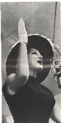
MUSIC SETS THE MOOD as Anita O'Day sings "Sweet Georgia Brown" in her husky, unique style in "Jazz On A Summer's Day," now playing at the Theatre.

The film "Jazz On A Summer's Day," which will open at the Theatre, on ..... shows one of the festivals, with all the entertaining incidents and social events surrounding it. After an initial burst of enthusiasm for the festival, Newport social leaders cooled off and there is still a hard core of ultra-conservative opposition to it, far outnumbered by members of Newport's upper crust who are finding as much enjoyment in this exciting event as the out of town visitors from all over the world. Original setting for the festival was Newport's ancient and hallowed Casino, where the famous tennis championships were played. But the festival was soon forced to find other quarters and the Lorillards bought the Belcourt Estate, which is now used for seminars, lectures and parties, while the evening jazz performances are held at the former baseball park, Freebody Park.