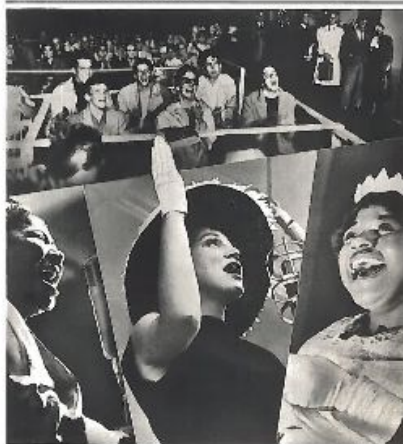
MUSIC SETS THE MOOD and the enraptured audience reacts with uninhibited pleasure. Anita O'Day, Mahalia Jackson, Big Maybelle are featured in "Jazz On A Summer's Day," coming to the Theatre, on ..... Also featured are Louis Armstrong, Gerry Mulligan, George Shearing, Chico Hamilton, Jimmy Giuffre, Jack Teagarden and Thelonius Monk. (Scene Mat 2A)

The first festival was presented to an audience of 6,000, which — at the time when this film was shot — had become 50,000.