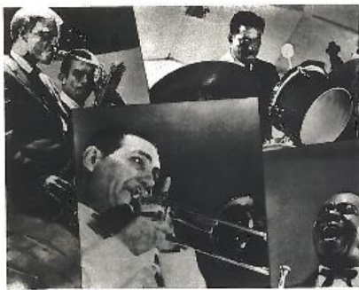
"JAZZ ON A SUMMER'S DAY," now playing at the Theatre, with the music of Jack Teagarden, Louis Armstrong, Gerry Mulligan and Chico Hamilton setting the mood. Also featured are Mahalia Jackson, Dinah Washington, George Shearing, Jimmy Giuffre, Anita O'Day and Thelonius Monk.